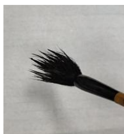
Figure 1. This is a loose front with a pen.

In order to give full play to the performance and potential of the brush, the brush “increase the pressure of the pen, press the pen down, the pen belly and even touch the paper, and then slightly twist the pen pole, the pen will be scattered, one front is divided into several fronts, forming a unique pen - loose front flowering pen”. The appearance of the loose front really broke through the shackles of the center’s pen, fully mobilized the front, abdomen and root of the Ying, and generated a new aesthetic character. The pioneering of Chinese painting brushwork makes the picture presents different appearance, also show new aesthetic characteristics: loose front brush with speed, rhythm, break through the traditional literati painting under the influence of zen concept characterized by detached, quiet, lonely “static” aesthetic character, and tend to “move” aesthetic tendency. (Figure 1)