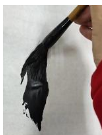
Figure 2. This is the reverse front into the pen.

The reverse front into the pen is in the stroke, the first pen tip to write the opposite direction of the pen, so that the stroke does not show the edge, is not to show the virtual tip, in order to make the strokes appear thick. Horizontal painting to right first left, vertical painting to the first, so that the pen front is hidden in the stroke, the beginning of the stroke is basically round. From the bottom up the line, the beginning of the pen and into the pen has a check. The new method of using the pen, the loose front brush and the reverse front into the pen, forming a changeable ink and unexpected effect. In particular, the loose front application is more like waving freely, and do not lose the method, such as living. Center pen, wing in, center line, wing out. (Figure 2)