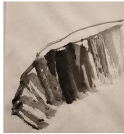
Figure 3. This is a pen and ink.

the legal requirements, no matter what kind of image, one ink is always the representative of balance, is always one of the balance and stable techniques. (Figure 3)