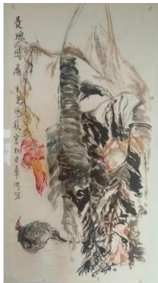
Figure 5. This is a sketching work.

In the process of sketching and creation, look for objects that have not been expressed, and express traditional images and different structures with traditional pen and ink. The ancients don't, you can't find the corresponding point, it is to study with what kind of ink symbol to show it, so soon formed their own language symbol, because you are different, object structure characteristics are not the same, choose different angle, plus the integration of personal aesthetic, laid your aesthetic different. To find your artistic language in the right direction. In the process of painting, we should observe the changes of objects, and in the changes of objects, the changeable image characteristics can be reflected through the changeable pen. Reflects its nature, vividness, ornamental and academic, the importance of sketching. Two strokes, one ink, three lines, propulsion composition, "contrast method" theory and so on, which benefited me a lot. I use this theory to carry out the whole process of sketching and creation, and the effect is really good. (Figure 5 )