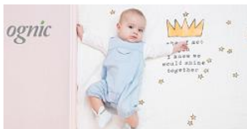
Figure 1. Representative picture of infant's apparel from Yuanzhen brand.

the fabric is dyed by plants, which is natural and environmentally friendly, providing healthy and organic clothes for children and conveying the healthy and low-carbon life conception; On the other hand, Yuanzhen brand has unique views on life and good aesthetic taste. It advocates a natural, free, comfortable and healthy lifestyle and represents a kind of life aesthetic attitude with restoring the original truth. The brand independently designs and produces new products. It not only strives for innovation and changes in style but also continuously innovates in fabric, and pursues the unity of product functionality and sensory aesthetics.